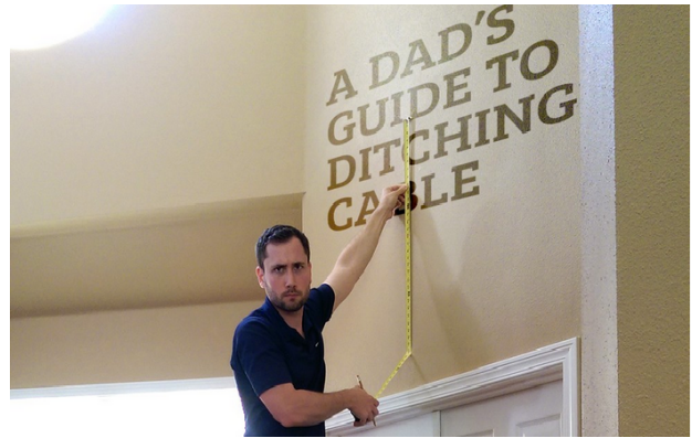
Figure 4. Installing a new streaming service [67].

F14 and F7 both blogged about arts projects they worked on with their children. F13 worked on crafts projects with his son, which he posted to Etsy, a peer-to-peer craft community. F13 blogged about making these crafts with his 3-year-old and posted pictures of them working together on social media. F22, a teacher by training, also worked on arts and crafts projects with his children. He emphasized both cost-saving benefits and the parenting value of doing these projects.