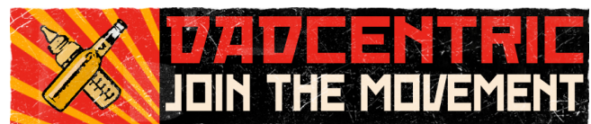
Figure 1. Blog Banner for Dadcentric [59].

This view echoes that of the creators of another community blog for dads called Dadcentric [59].