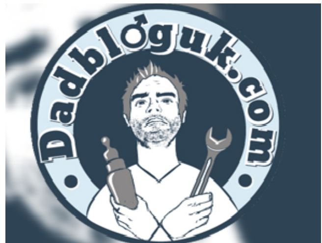
Figure 3. Blog Banner for Dadbloguk [65].

Another blog, Dadbloguk [65], featured a graphic (see Figure 3), where a cartoon figure resembling the author holding a baby bottle in his left hand and a wrench in his right hand with one arm crossing over the other. This image is reminiscent of common DIY maker imagery circulating online and in periodicals like Make Magazine , depicting both men and women in firm poses with tools in their hands.