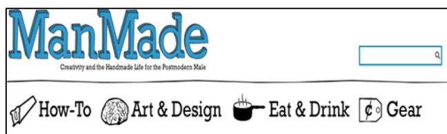
Figure 6. Manmade Blog Banner [69].

Another blog, Manmadediy [62] (see Figure 6), whose author describes himself as a “postmodern male” advancing “creativity and handmade life,” provided how-to guides for other fathers such as home improvements, arts and crafts, as well as “food innovations.”