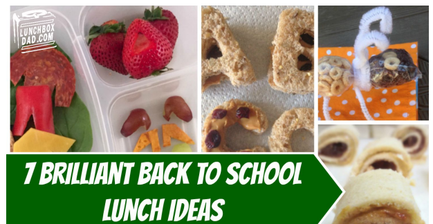
Figure 5. Innovative Lunchbox ideas from Lunchbox dad [68].

Some blogs focused specifically on the creation of “innovative” and “nourishing” food choices for their children. “Lunchbox Dad” [68], for instance, blogged exclusively about how to make food more enjoyable for his own and other children (see Figure 5).