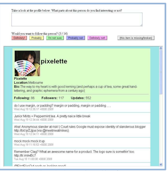
Figure 3. The experimental interface.

Subjects' stated preferences in laboratory experiments do not